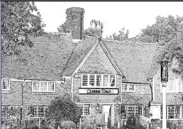
The Queens Head Sedlescombe